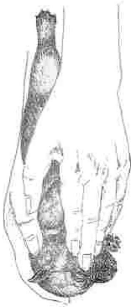
Figure 4 Figure Supine position