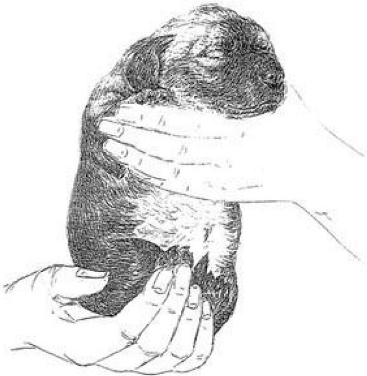
Figure 3 Head pointed down