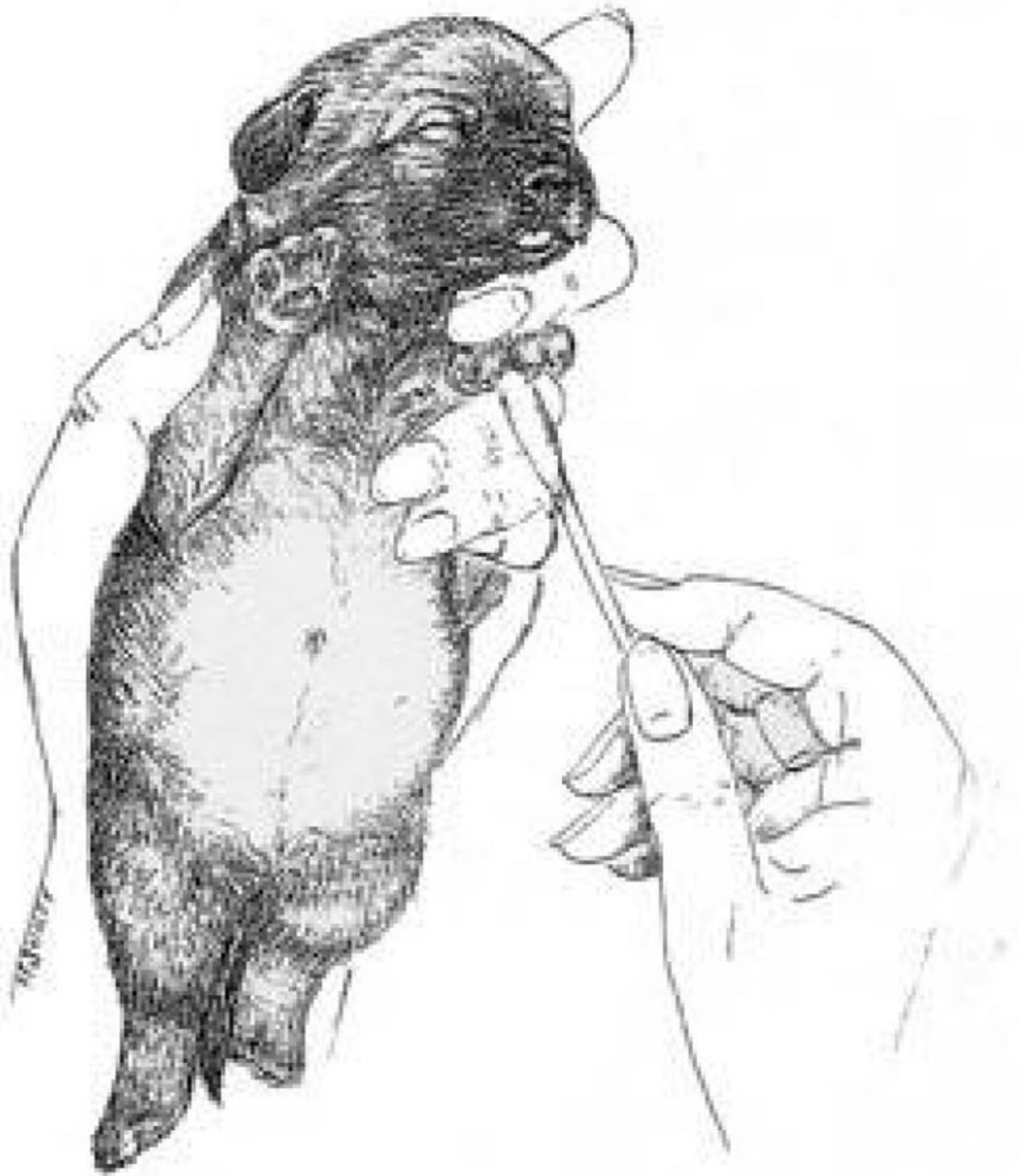
Figure 2 Head held erect